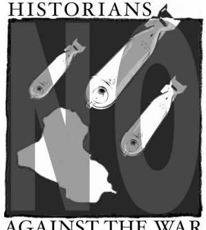
AGAINST THE WAR

February 15 and 16, 2003 http://www.historiansagainstwar.org/